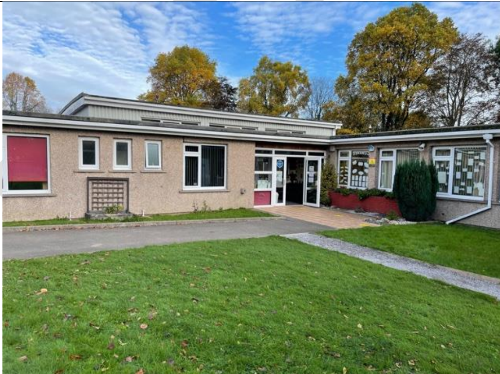
The main entrance to Craig yr Hesg Primary School

The accessibility of the site itself and the school building requires improvement to comply with the Equality Act 2010. The low-level perimeter fence to the front of the school site is insufficient to stop individuals accessing the site outside of school hours.