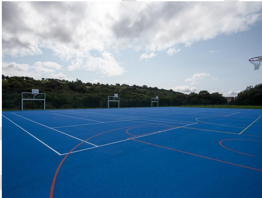
Example of Multi-Use Games Area (MUGA) at Tonyrefail Community School.