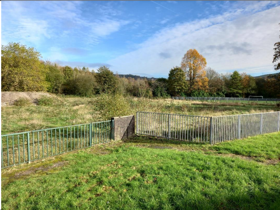
Land adjacent to Craig yr Hesg Primary School - former site of Ty Gwyn Pupil Referral Unit