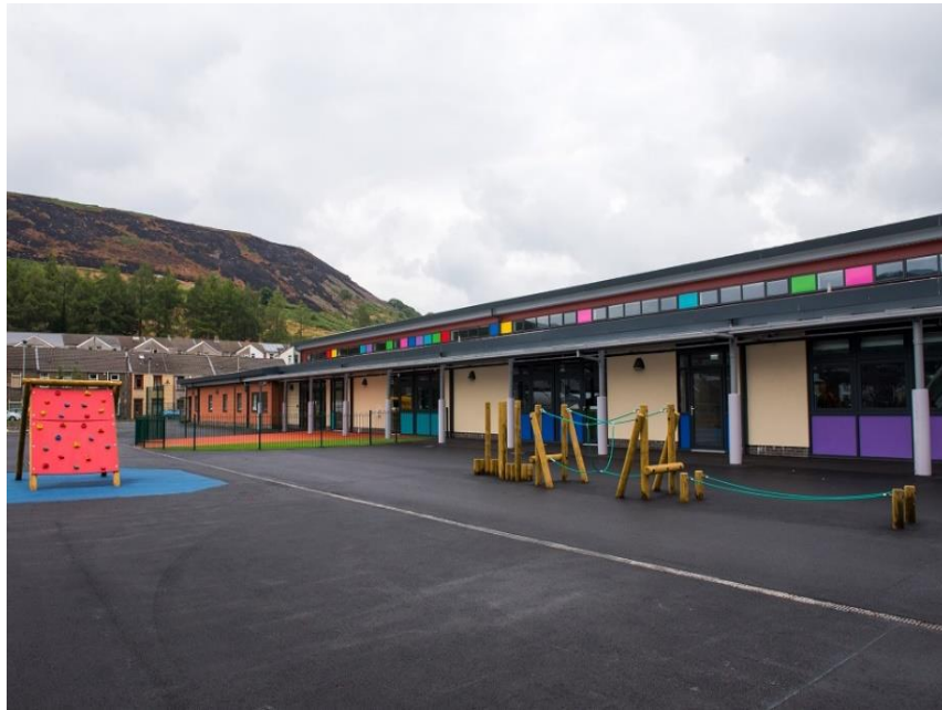
External view of Cwmaman Primary School opened by the Council in 2018.