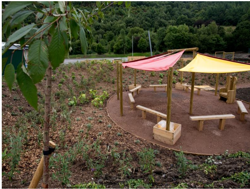
Example of outdoor learning area at Cwmaman Primary School.

There will be on-site provision for staff parking as well as consideration of an on-site drop-off facility for pupils (subject to further surveys and the transport and traffic assessment).