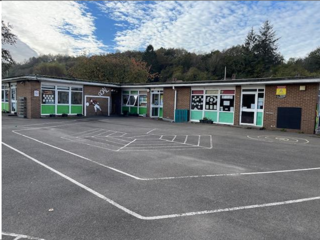
View of school building from rear of site.

The pupil numbers in Craig yr Hesg Primary School over the past five years are shown in the following table. They were obtained from the statutory Pupil Level Annual School Census (PLASC) which must be undertaken in January each year. The number of nursery age pupils for each year is shown separately, as required by the Welsh Government’s statutory School Organisation Code (2018).