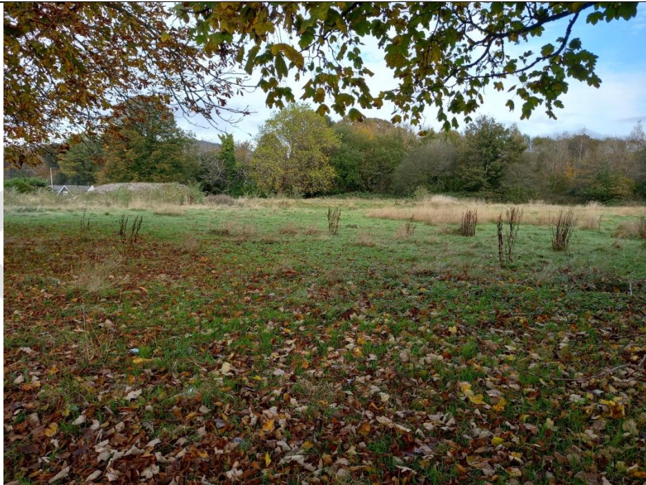
View of adjacent land from the Craig yr Hesg Primary School site

In accordance with the School Organisation Code 2018, further alternative options were also identified and consciously considered. Some of the benefits and disadvantages of each of the discounted options are listed in the table that follows: