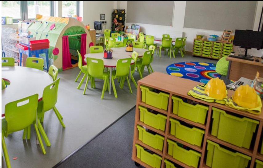
Typical foundation phase classroom in a 21 st Century School delivered by the Council.

The school will be built in accordance with Building Bulletin 99 which requires new primary schools to include provision for team sports, including a playing field area suitable for team games for pupils aged 8 and over and a Multi-Use Games Area (MUGA) for sports such as basketball and netball. New schools are also required to include soft play areas, commonly made up of grassed space for pupils to sit and socialise, alongside hard surfaced playgrounds and sheltered space to complement the soft play areas around the school site. The new school will also include a habitat area which will act as a space for outdoor learning and provide a valuable teaching and learning resource.