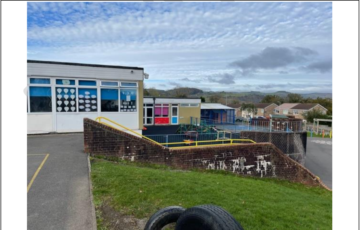
View of the school building from the Junior yard.