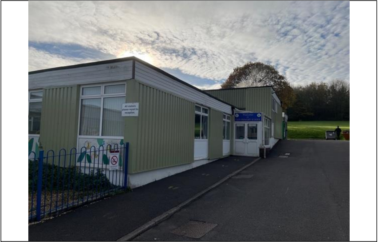
The main sloping entrance to Cefn Primary School.