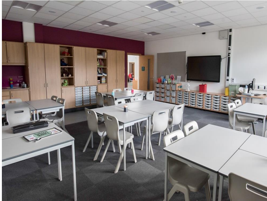
Typical junior classroom in a 21 st Century School delivered by the Council.